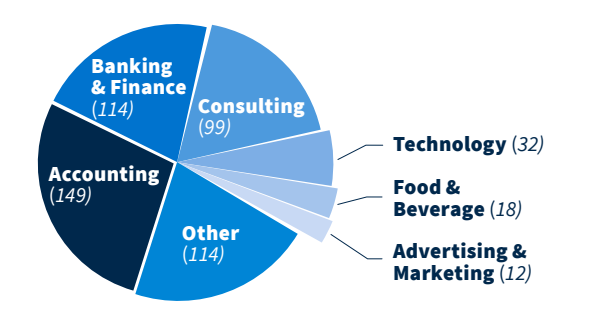
Top Industries for Students Accepting Full-Time Employment

Top Degrees Pursued by Students Enrolling in Additional Education after Graduation